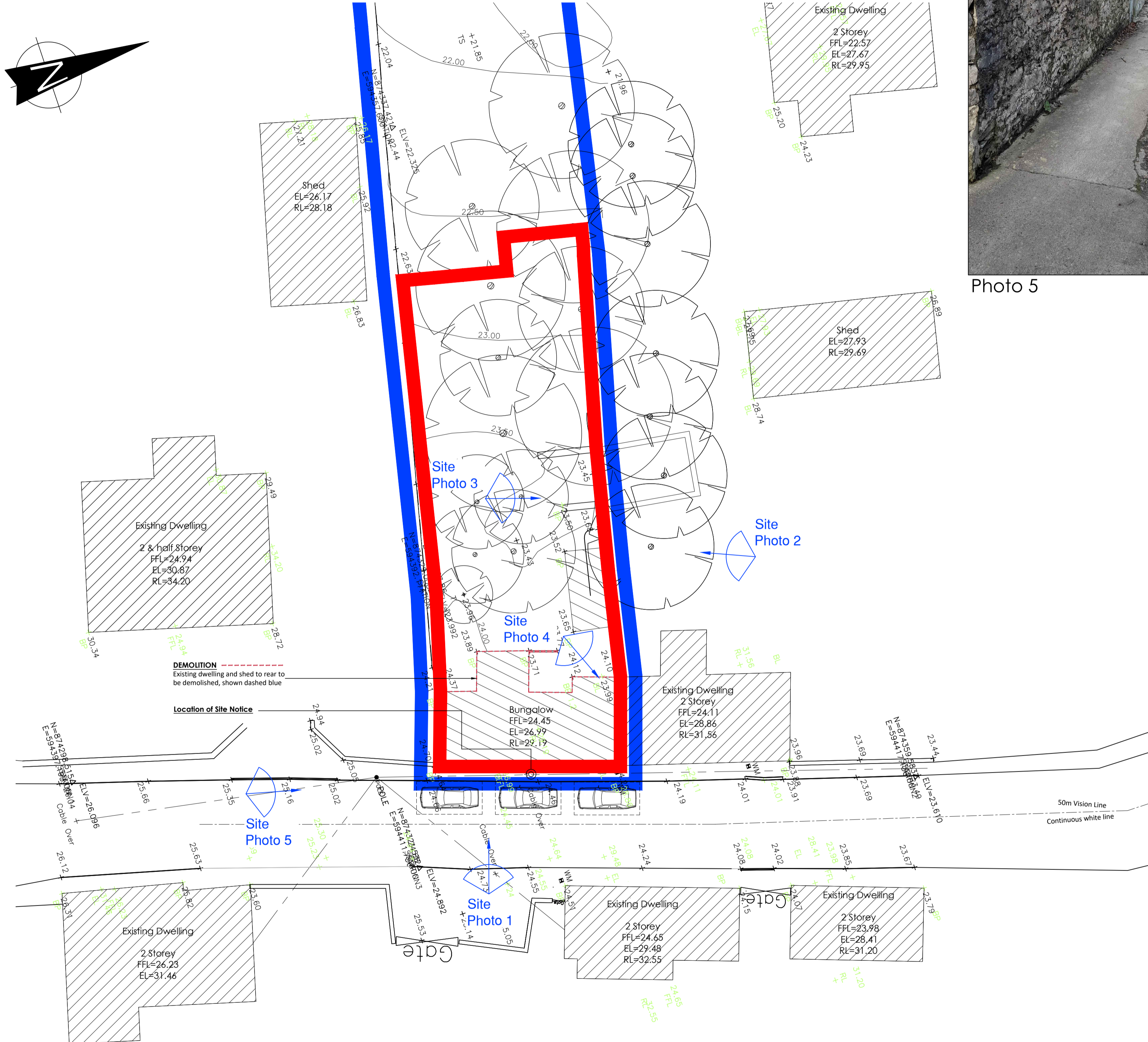
Existing Site Survey. Scale 1:200