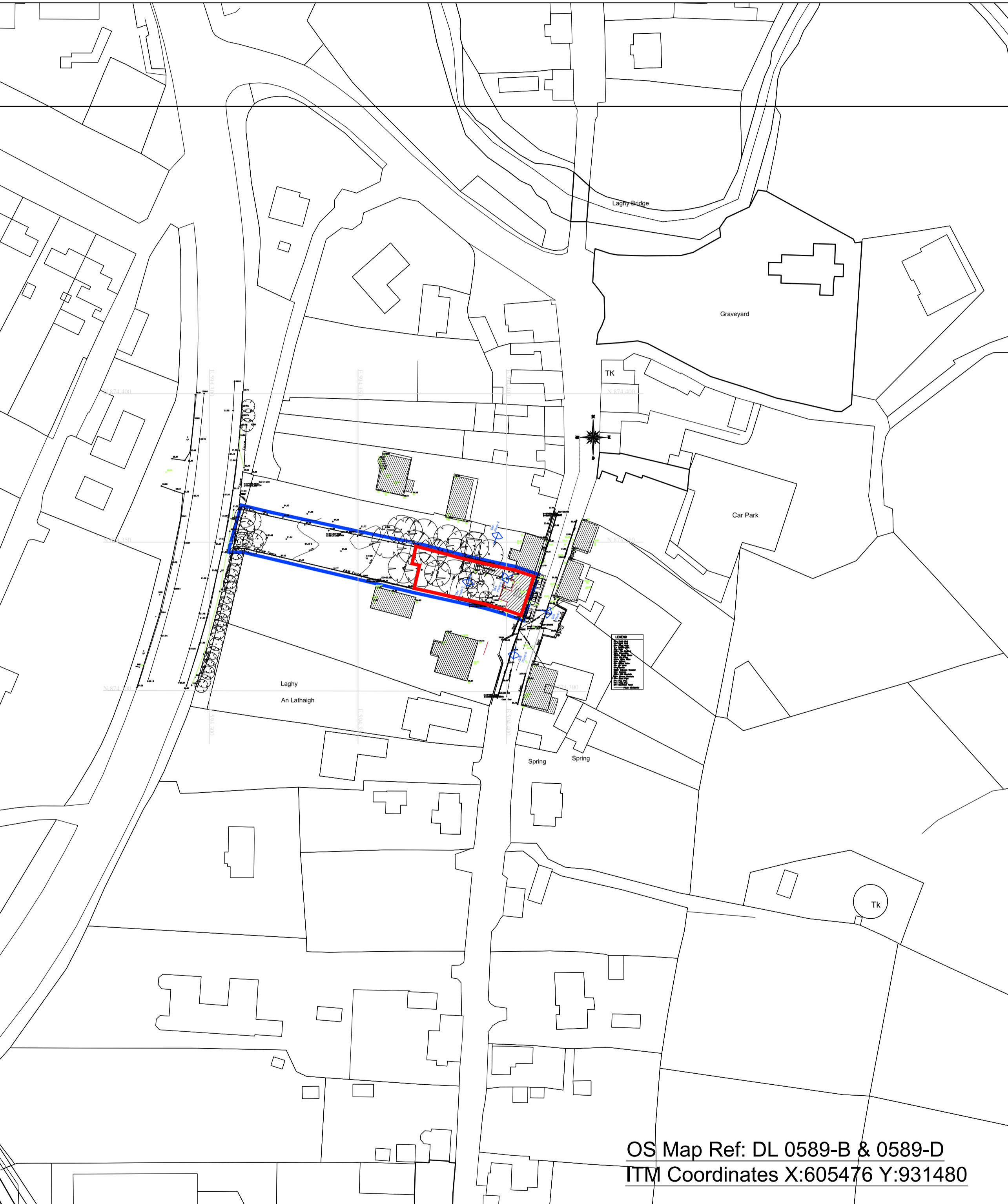
Site Location Map Scale 1:1000